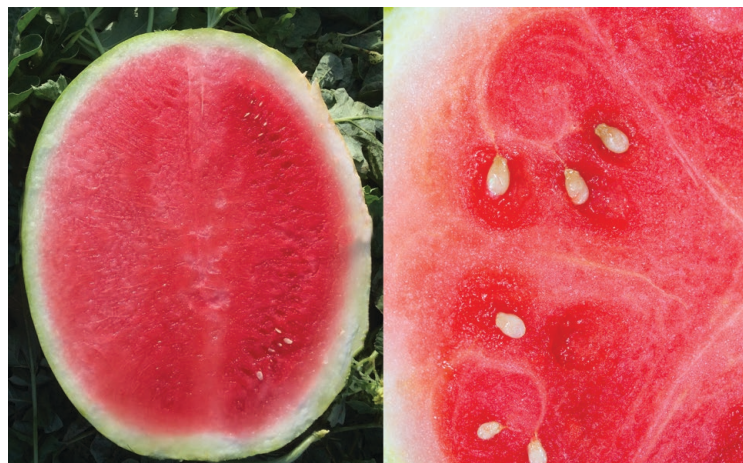
Figure 2. Triploid watermelon fruit can contain the white, soft, edible seed coats (pips) of non-viable seed.

Although characterized as “seedless”, fruit produced by triploid watermelon plants can contain small, soft, white to cream colored empty seed coats of seeds that failed to mature, known as pips (Figure 2). The pips are edible, similar to the seeds in a young cucumber or zucchini. 1 Because of the random segregation of chromosomes during the process of ovum production in the triploid female flowers, occasionally a viable embryo can form and develop into a typical dark, hard seed, similar to those found in seeded fruit. However, the occurrence of such seeds is rare. 5